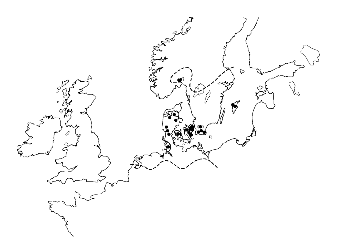
Map 6. The find context for gold bracteates. 1. depot, 2. grave, 3. approximate limit between depots and graves.